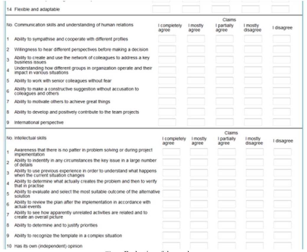
Fig-6. Evaluation of the employer