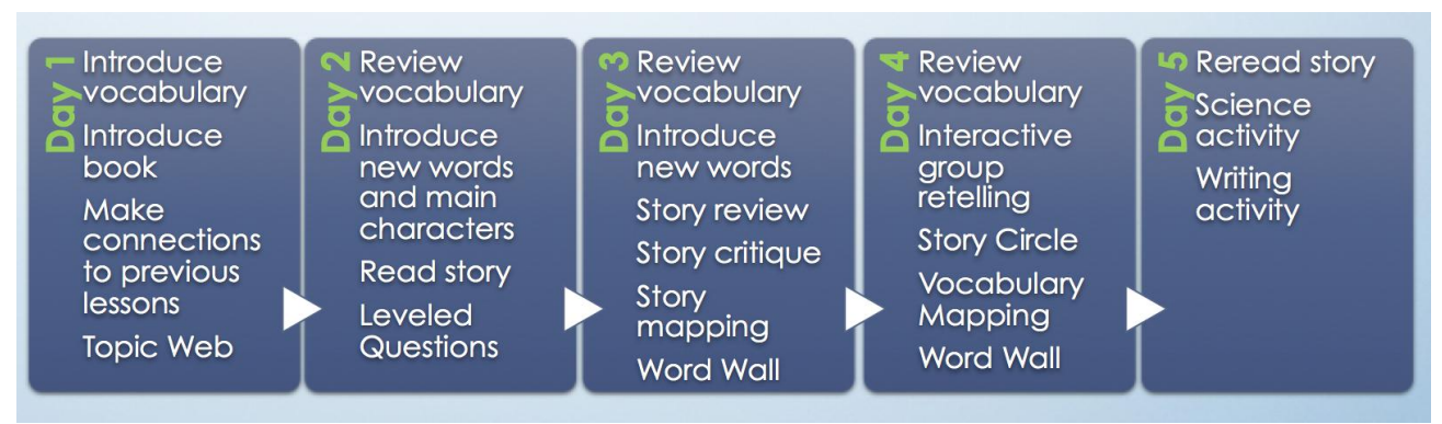
Figure-1. STELLA 5-day lesson.