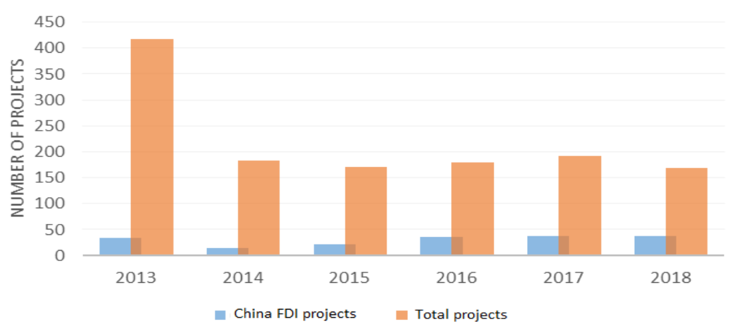
Figure-1: China's registered projects verses total number of registered projects.

From the Table 1 the data collection were based on the quarterly reports by the Ghana Investment Promotion Centre. However, there was no data for registered projects by China and the estimated cost of projects in the third quarter of 2013 whereas there were no records on the number of registered projects for the second quarter of 2014. China registered one project in the second quarter of 2015 but there was no record on the estimated cost of the project as it was not captured by the GIPC as it was not ranked among top ten (10) investment cost of projects.