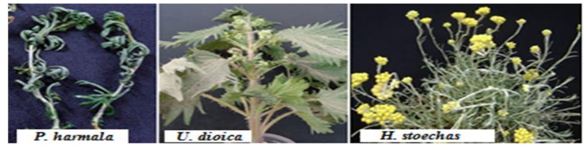
\label{eq:Fig-1.Types of used plants} Fig-1. Types of used plants

Fifty grams of each of above mentioned botanical plant materials in powder form was homogenized by laboratory blender in 50 ml distilled water for 10 min, then left in dark place for 24 h for tissue maceration. The extracts were filtered through thin cheesecloth sheets. The final extracts/supernatant were filtered through Whatman No. 1 filter paper and sterilized by Zeits filter (0.24 \mu l), then collected separately in sterile dark glass tight bottles. The obtained extracts served as the crude extract (100 % concentration) and kept in a refrigerator at 4°±1 until use.